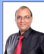
AdbuNabi Utman Islamic Studies